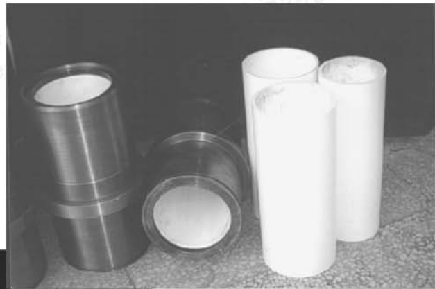
Cylinder liner for slurry pump