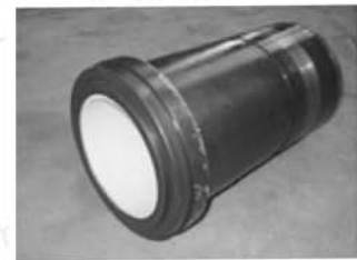
Cylinder liner for slurry pump