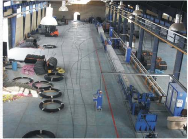
Spring steel wire heating treatment line on site