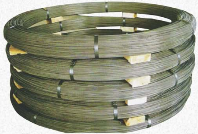
PC Steel bar