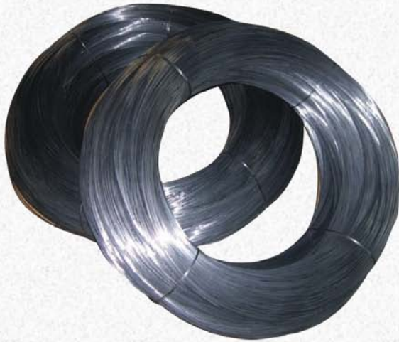
Spring steel wire