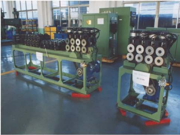
Straightening and hauling machine of Pipe pile steel wire heating treatment line